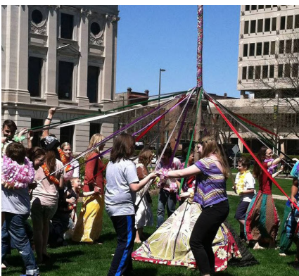
Maypole on the courthouse lawn

The Allen County Public Library received the community's help to document specific days in Allen County, Indiana. Here are some highlights from a decade ago!