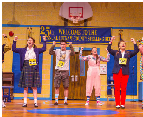
25th Annual Putnam Co. Spelling Bee at Arts United Center